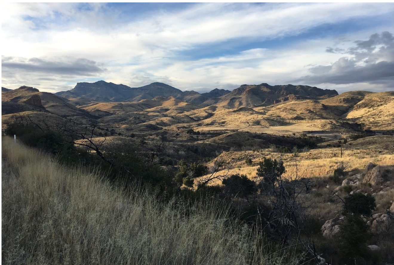
Pajarito Mountains, Arizona

January 21, Day 1: Arrival in Tucson. Participants may plan to arrive in Tucson at any time today and proceed to our hotel where a room will be reserved in your name. We will meet in the hotel lobby at 5:30 p.m. for a brief orientation session followed by dinner.