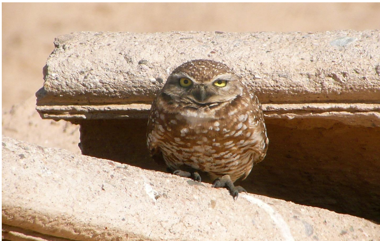
Burrowing Owl, Santa Cruz Flats, Arizona

NIGHT: Hampton Inn and Suites, Tucson Airport