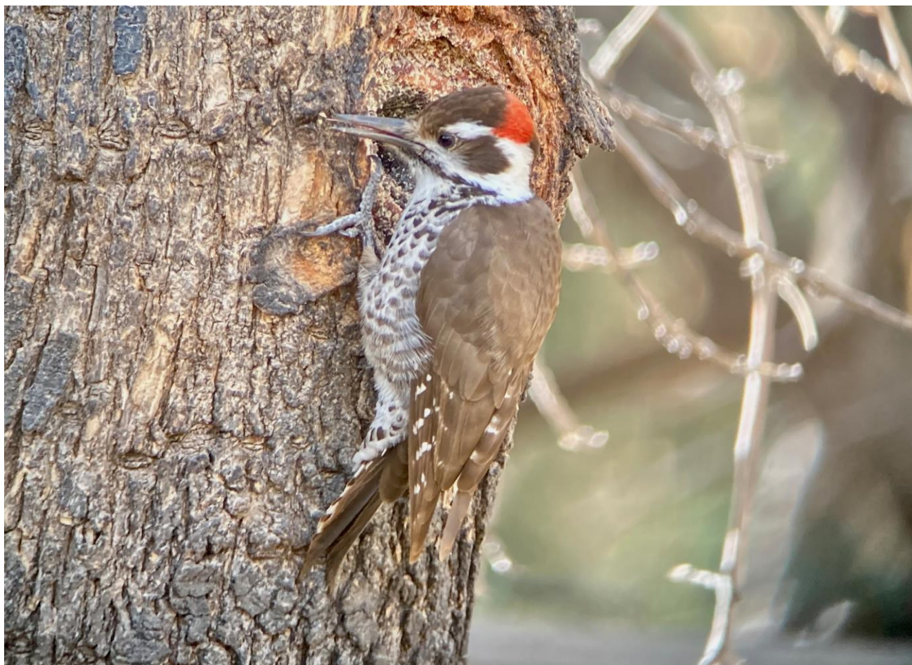
Arizona Woodpecker, Madera Canyon, Arizona

NIGHT: Hampton Inn and Suites, Tucson Airport