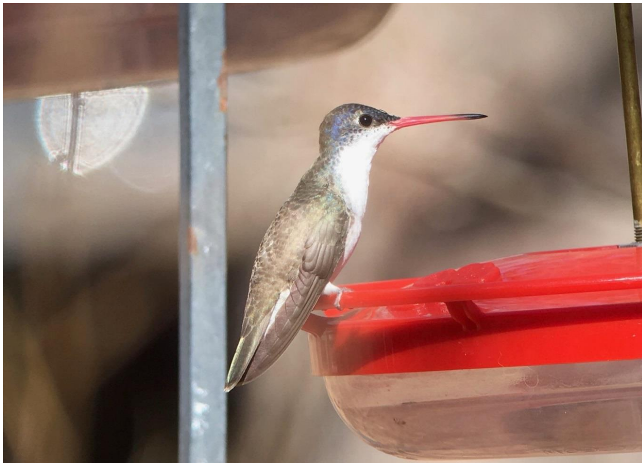
Violet-crowned Hummingbird, Patagonia, Arizona

January 25, Day 5: Sulphur Springs Valley. A longer drive today will lead us to the birdy Sulphur Springs Valley. This area is renowned for its great raptor viewing with uncommon species such as Ferruginous Hawk and Prairie Falcon likely during the course of the day. Red-tailed Hawks and Northern Harriers abound, and there should be a sprinkling of accipiters as well. Toward the southern end of the valley large concentrations of Sandhill Cranes (about 20,000) gather around Whitewater Draw. The sights and sounds of thousands of cranes at once is always a highlight. Whitewater also attracts a good variety of waterfowl and may harbor Snow and Ross's goose, Wilson's Snipe, Horned Lark, Black Phoebe, and Vermilion Flycatcher. The grasslands and agricultural areas of the valley also host large numbers of wintering sparrows with Lark Bunting and Brewer's Sparrow among the expected species. Other targets here include Scaled Quail, Great Horned and Barn owls, Bendire's Thrasher, Crissal Thrasher, and possibly longspurs.